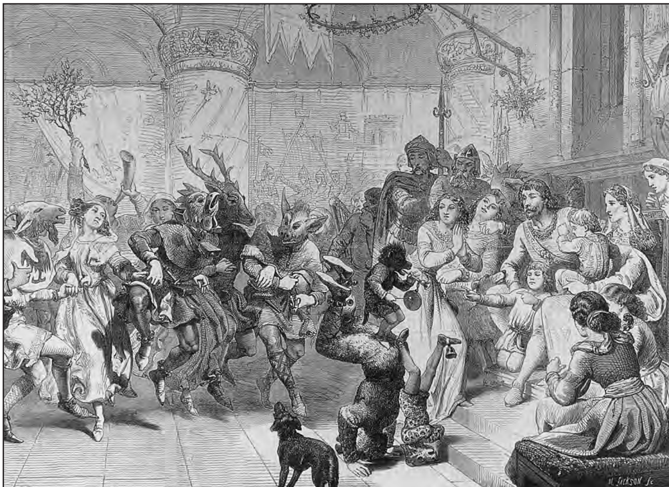
Mummers at Christmas in the Olden Time from The Illustrated London News , December 22, 1866 By E. N. Corbould

celebration called Saturnalia, which started December 17th and lasted for a week. During this celebration, men and women exchanged clothing and participated in wild merrymaking. The mummers in wild disguises would go from house-to-house or court-to-court, partaking in the Christmas cheer and merriment.