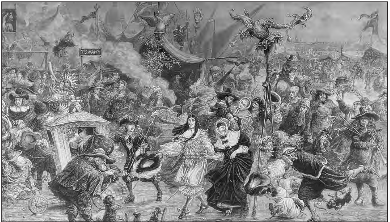
Vanity Fair—Christmas 1683 from Graphic, Christmas Number December 25, 1876

Henry VIII was King of England from 1509-1547. It was during his reign when the Christmas masque came into fashion. The illustration of Henry VIII depicts