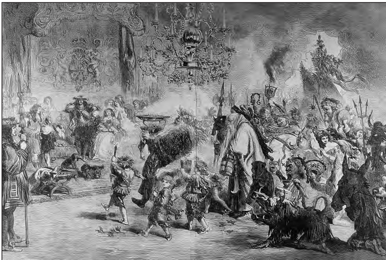
Christmas Masque at the Court of Charles II from The Illustrated London News , December 24, 1859

The custom of mumming had its roots in the Roman