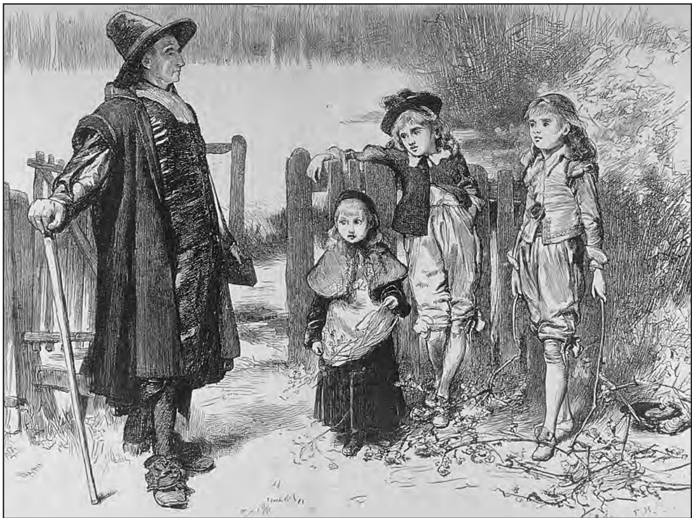
Christmas in New England-Colonial Times from Harper's Weekly , December 25, 1875

fined anyone caught trying to participate in Christmas in any way. However, this law was rescinded twenty-two years later, but it was not until the nineteenth century that New Englanders started celebrating Christmas. Up until then the real seasonal celebration was on New Year's. With the exception, of course, of the German immigrants who celebrated Christmas in America as they did in their native Germany, on December 25th.