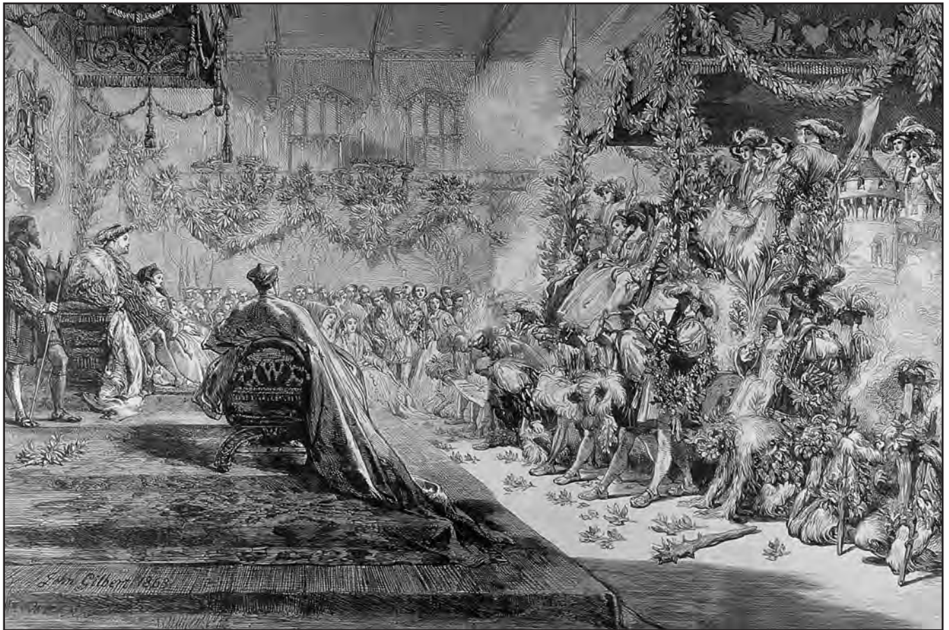
King Henry VIII Keeping Christmas at Greenwich from The Illustrated London News , December 19, 1863 By John Gilbert

great yellow ruff: his torch-bearer carried a basket with a cheese and a rope. Carol had a red cap and a long tawny coat, with a flute hanging at his girdle: his torch-bearer carried a song book, open. Minced Pie was neatly dressed as the cook's wife; her man carried a pie on a dish, and a spoon. Gambol appeared as a tumbler, with a hoop and bells; his torch-bearer was armed with a 'colestaff' and a blinding cloth. Post and Pair had a pair-royal of aces in his hat; his garment was done over with 'pairs and purs:' his squire carried a box with cards and counters. New Year's Gift was like a serving-man, in a blue coat, with an orange, and a sprig of rosemary gilt on his head; his hat is stuck full of brooches, and his collar is made of gingerbread: his