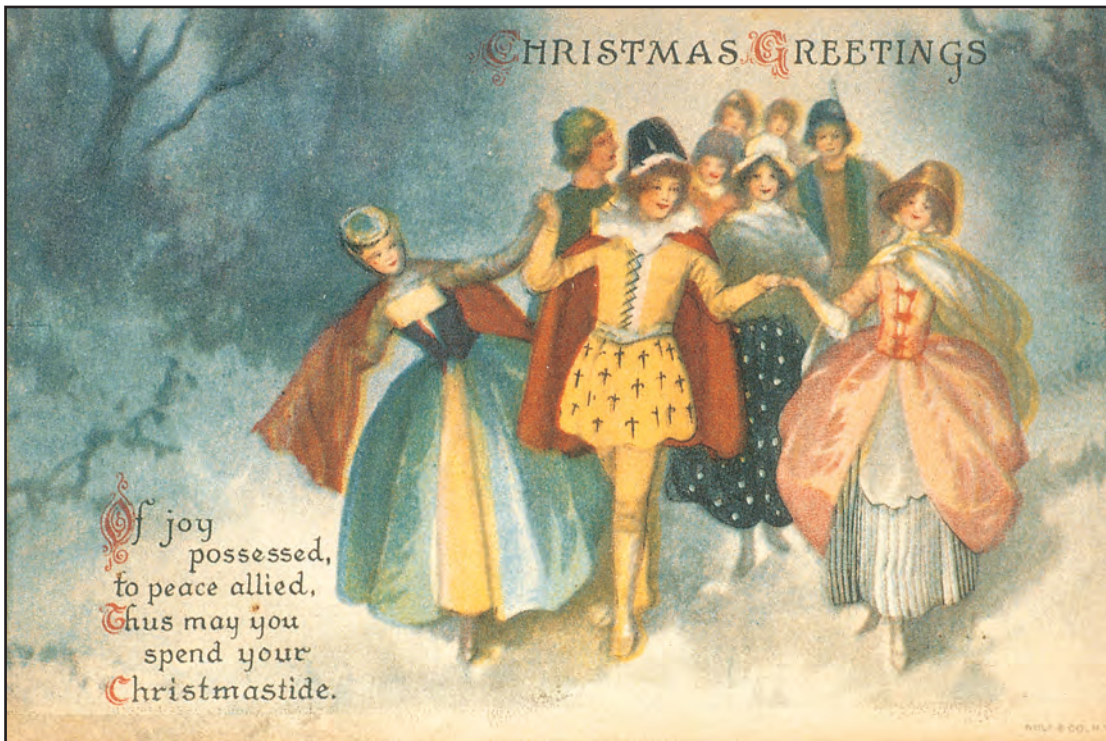
Vintage postcard, ca. 1910