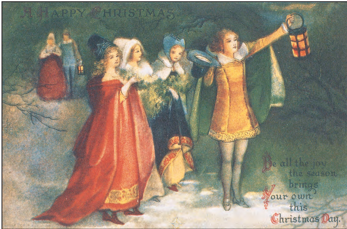
Vintage postcard, ca. 1910